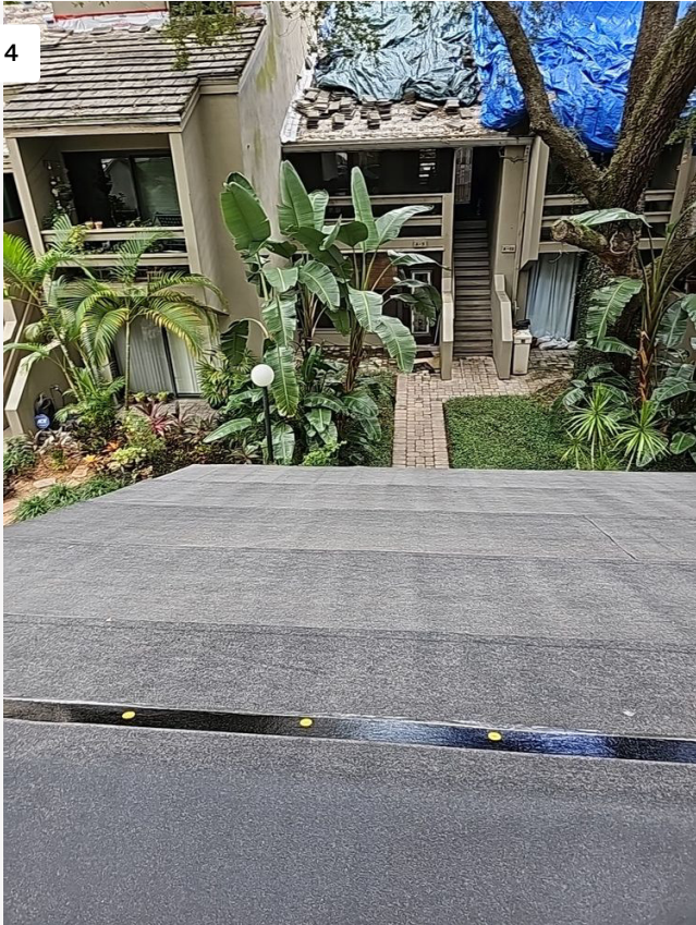
Project: Sunfish Bay-Bldg A Date: 8/17/2023, 1:36pm