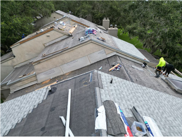
Project: Sunfish Bay-Bldg A Date: 8/28/2023, 11:54am