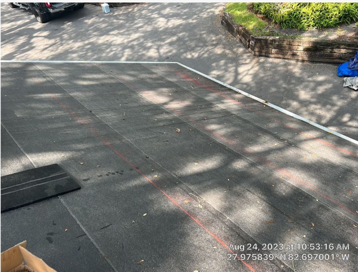
Project: Sunfish Bay-Bldg A Date: 8/24/2023, 10:53am