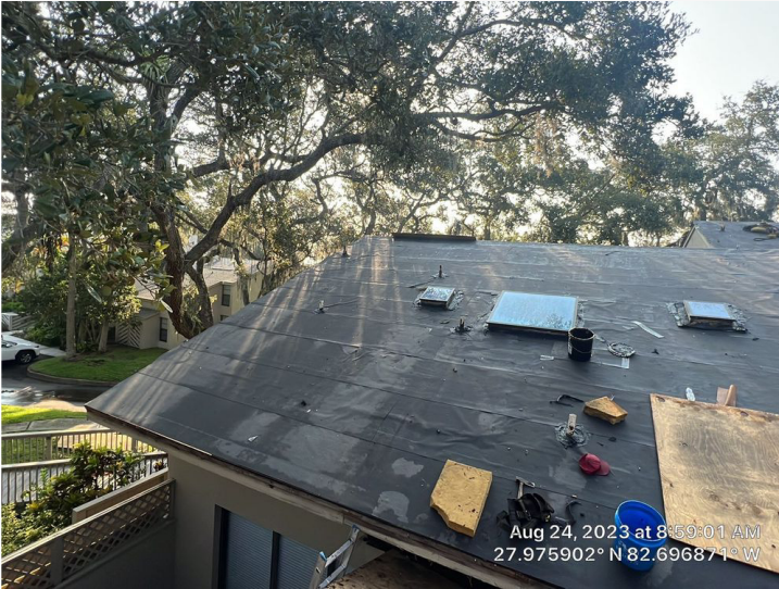
Project: Sunfish Bay-Bldg A Date: 8/24/2023, 8:59am