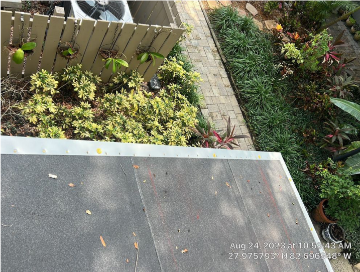
Project: Sunfish Bay-Bldg A Date: 8/24/2023, 10:53am