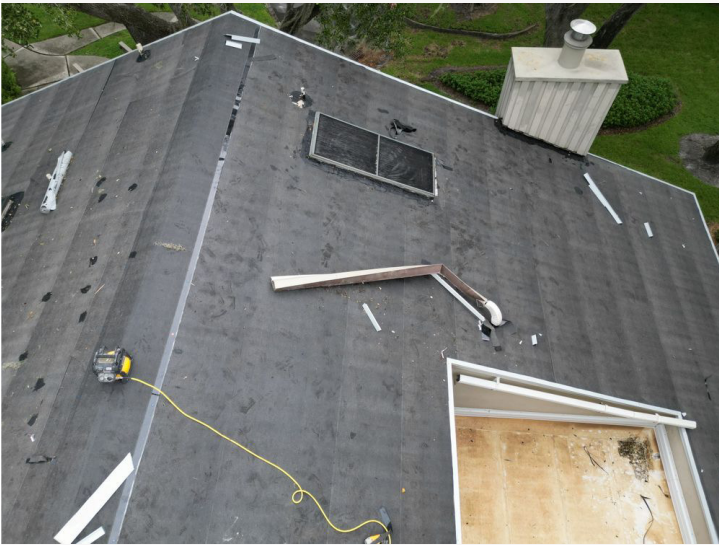
Project: Sunfish Bay-Bldg A Date: 8/28/2023, 11:55am