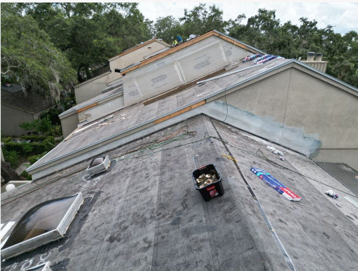
Project: Sunfish Bay-Bldg A Date: 8/28/2023, 11:53am