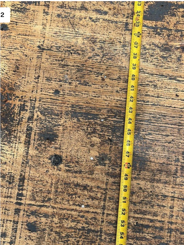
Project: Sunfish Bay-Bldg A Date: 8/15/2023, 11:40am