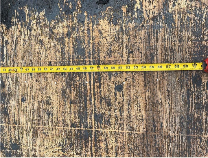
Project: Sunfish Bay-Bldg A Date: 8/15/2023, 11:40am