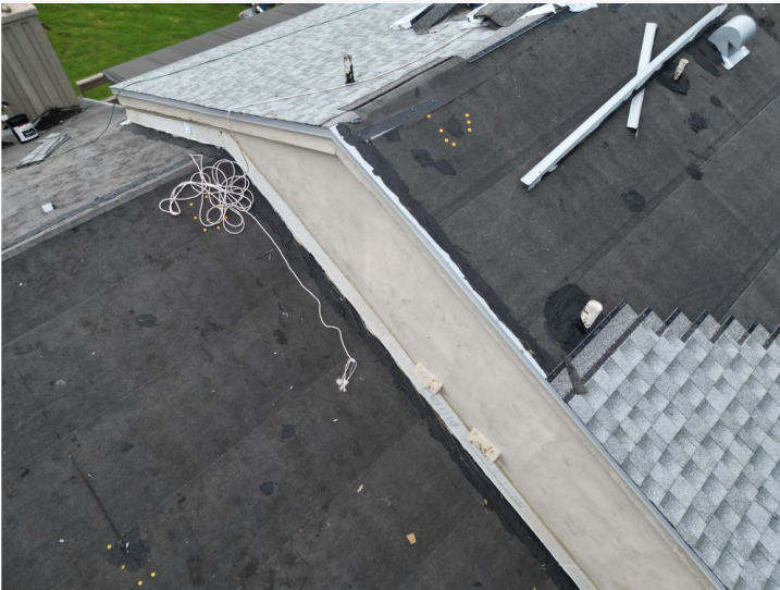
Project: Sunfish Bay-Bldg A Date: 8/28/2023, 11:58am