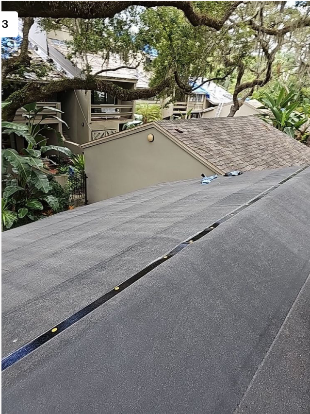
Project: Sunfish Bay-Bldg A Date: 8/17/2023, 1:36pm