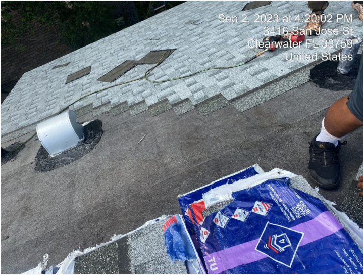
Project: Sunfish Bay-Bldg A Date: 9/2/2023, 4:20pm