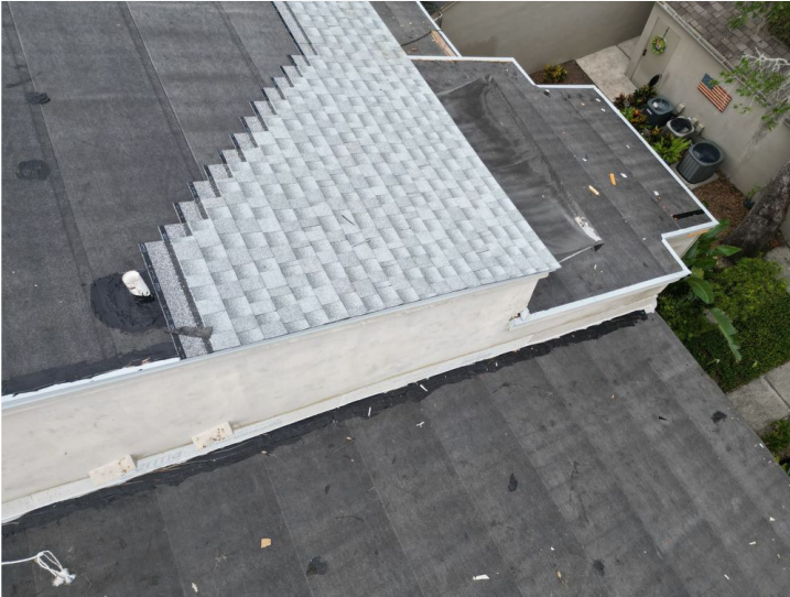
Project: Sunfish Bay-Bldg A Date: 8/28/2023, 11:58am