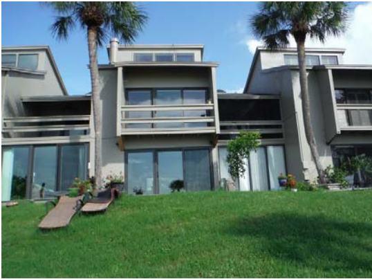
3 Rear of Building D