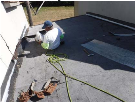
7 Peel & Stick Underlayment