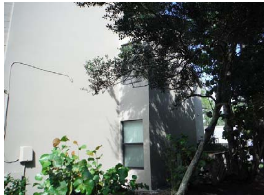
4 Left Side of Building D