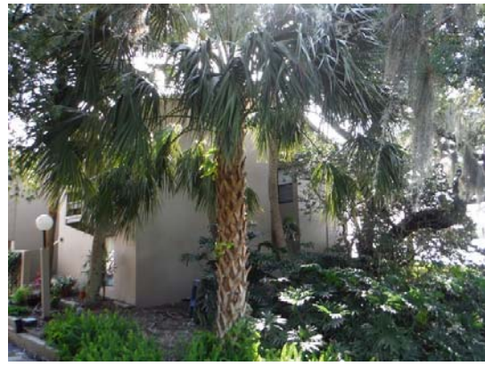
2 Right Side of Building D