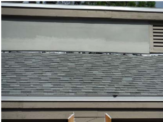
5 Roof Covering