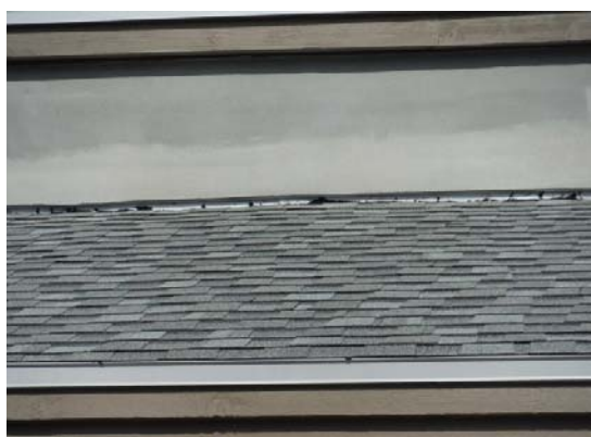
6 Roof Covering