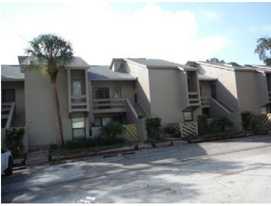
1 Front of Building D